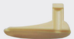
Mounting tool cover