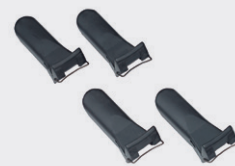
Kit of four rubber coated jaw protectors