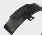
Plastic protection suitable for bead breaker