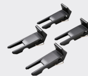
Jaws plastic protection kit