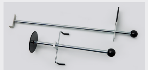
Steering wheel lock