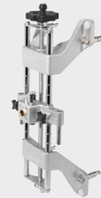
Four precision jaws for all standard rims