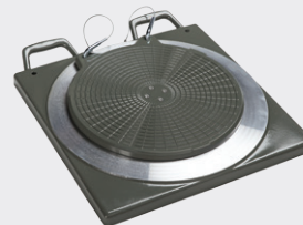
Set of 2 aluminium turnable plated with pads 450x450 thick 50 mm capacity 1000 kg