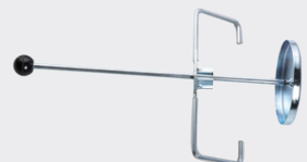
Steering wheel lock